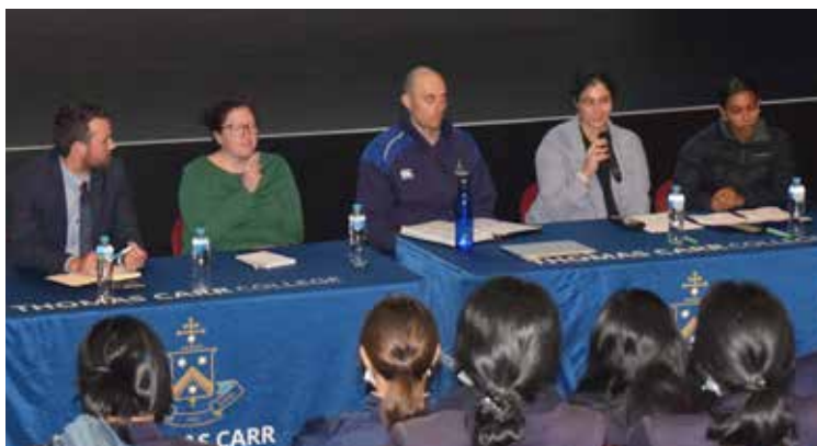
VCE Study Skills Workshop