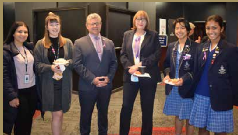
International Women's Day Breakfast