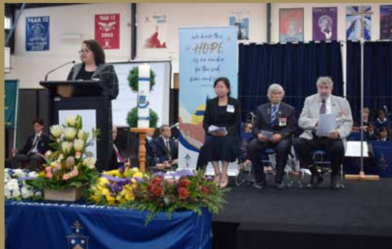
Malaya & Borneo Remembrance Service