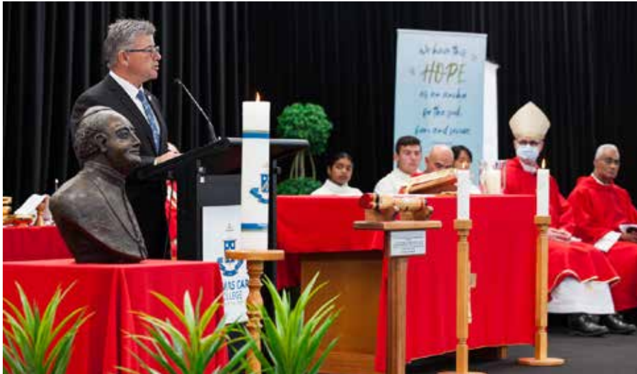
Thomas Carr Day Mass 2021

Joe Biden, on stage at the Global Citizen Festival New York, 2015