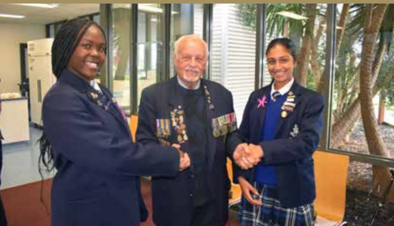
Malaya & Borneo Remembrance Service

During the Assumption Term, we will hold further 25th Anniversary events: Thomas Carr Carnival Day, Alumni and Staff Trivia Night and Good Samaritan Country Campus - Family Fun Day as well as many other events. In the final term of 2021, we will hold our inaugural Gala Night of Excellence, our Year 12 Graduation celebrations, and A Night to Shine – all College community events which showcase the achievements, strengths and talents of our students and staff, as inspired people of Hope.