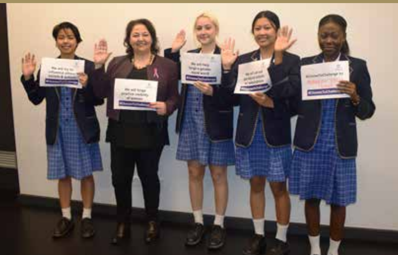
International Women's Day Breakfast