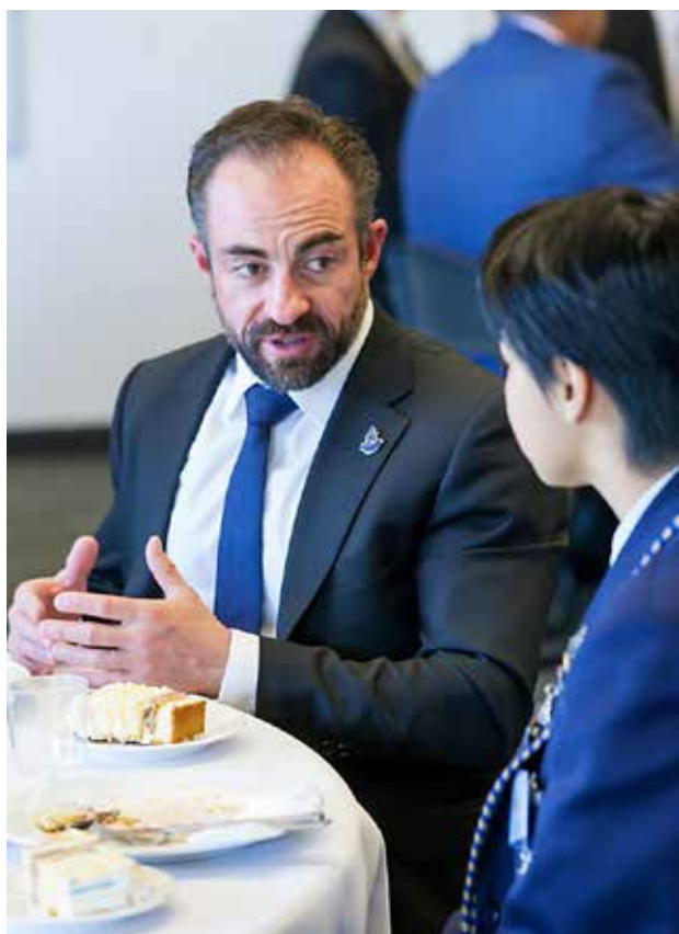
Thomas Carr Day Mass & 25th Anniversary celebration

These programs are in addition to the wonderful support and guidance our teachers provide in and outside of the classroom daily to cater for the learning needs of our students. Such programs are also further evidence of our commitment to supporting the learning and wellbeing needs of our students.