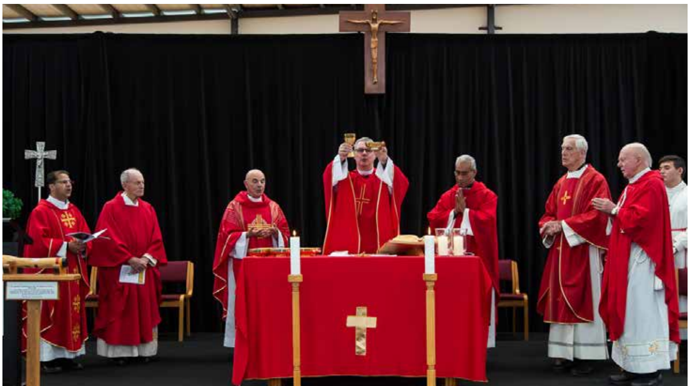
Thomas Carr Day Mass 2021