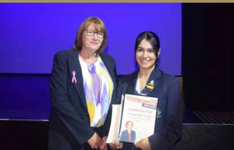
International Women's Day Breakfast